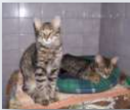
Jake & Blake

still need to be trapped. Timing is critical so that if these cats do have to go to other homes in the area, they will not continue to breed. Paws Patrol is providing the food for these cats, a cell phone for the caregiver whose phone was cutoff, and raised some funds for daily needs until financial help is available. We are also looking for temporary homes for her 8 personal cats, if the foreclosure happens, until she can find available housing.